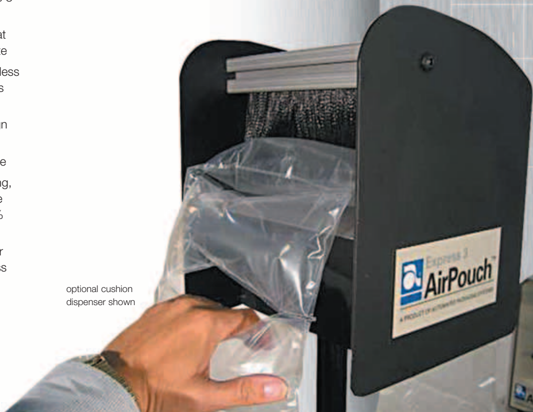
optional cushion dispenser shown